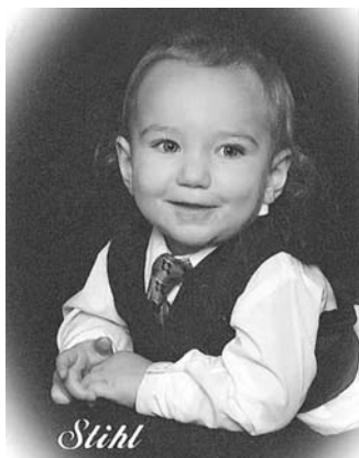
Stihl Edward Steen Assembly 0039