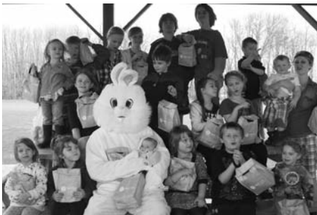
Youth members surround the Easter Bunny to show their appreciation to NSS for their lunch bags.