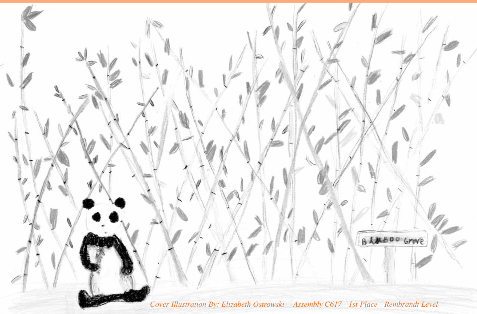
Cover Illustration By: Elizabeth Ostrowski - Assembly C617 - 1st Place - Rembrandt Level