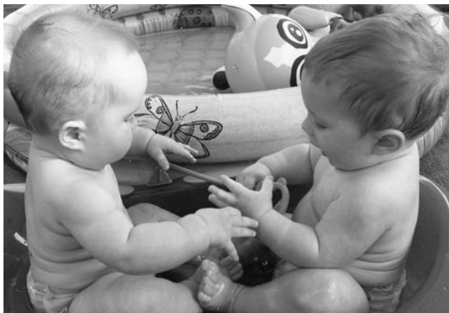
Cousins, Benjamin Gaither and Cameron Mason beat the heat at the Canfield Fair's campgrounds on Youth Day when temperatures were in the upper 90's.